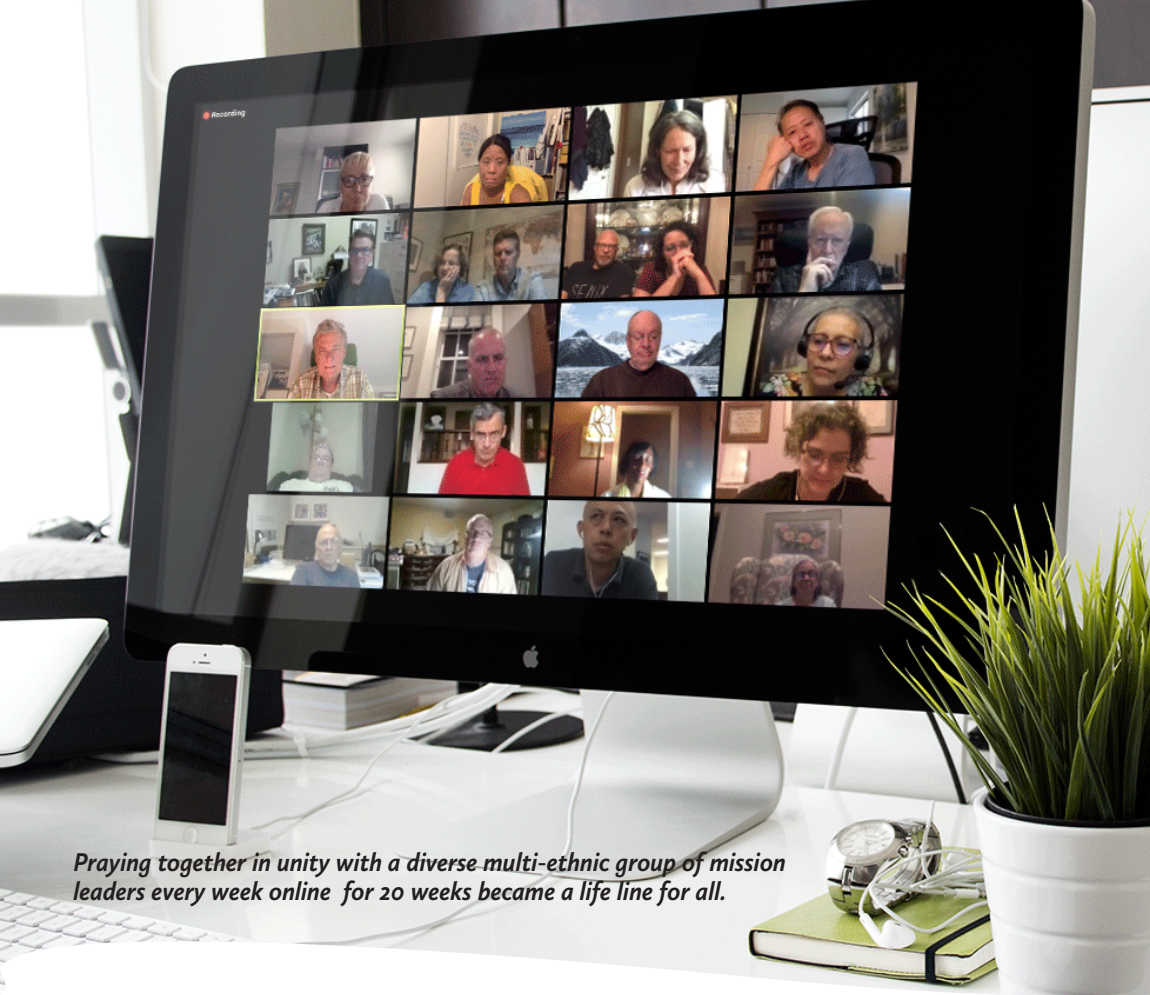
Praying together in unity with a diverse multi-ethnic group of mission leaders every week online for 20 weeks became a life line for all.