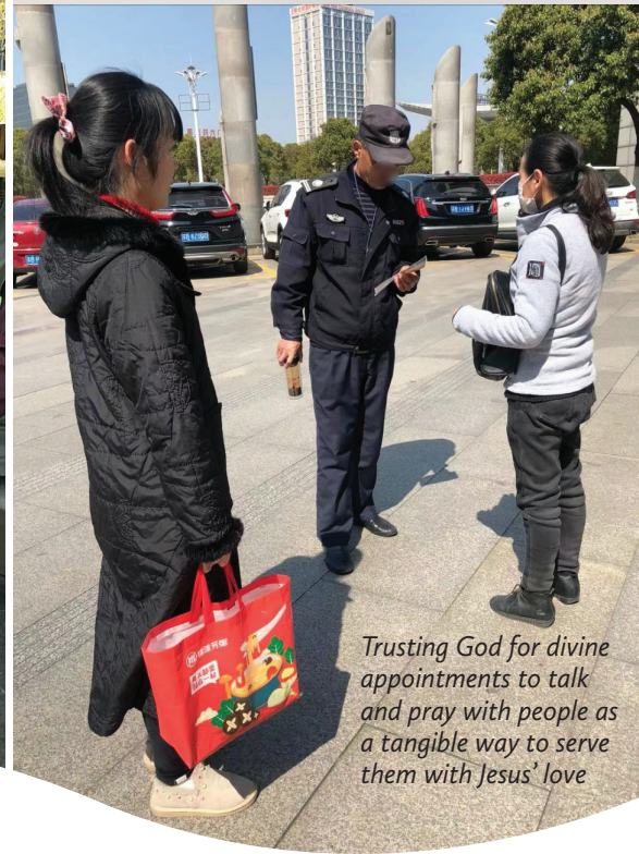
Trusting God for divine appointments to talk and pray with people as a tangible way to serve them with Jesus' love