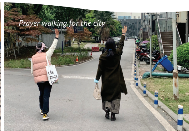
Prayer walking for the city