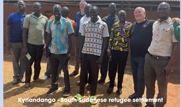
Kyriandango - South Sudanese refugee settlement

We are blessed to be invited by Edgewood Ministries to teach prayer and evangelism to 60 key African leaders in Uganda this June. Africa's population is expected to grow to 2.5 billion by 2050 which will account for more than a quarter of the global population and with a median age of below 20 years and we are excited to have the opportunity to work in this harvest field.