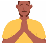
A praying person with hands folded upward in hopeful prayer